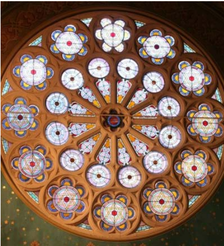
Inside: The Rose Window